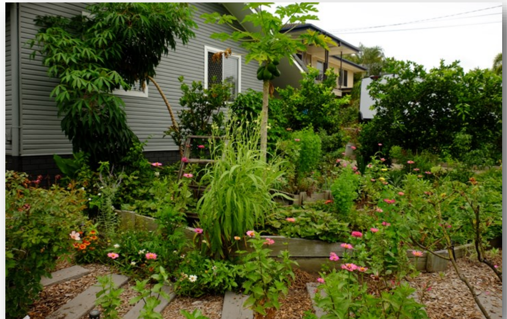
Below: Lots of flowers and food