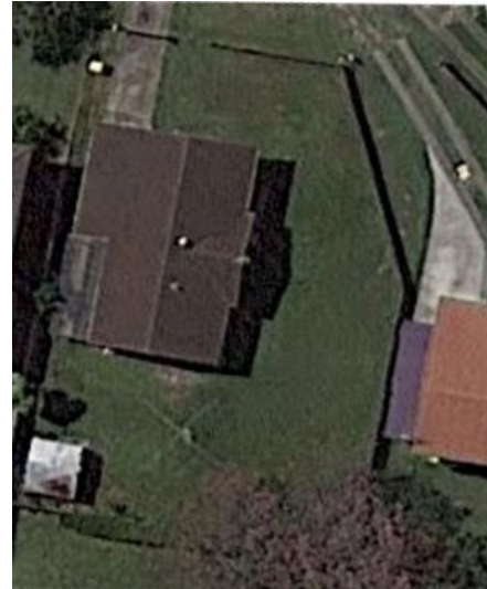
Left: Kat's property when she bought 6 years ago

If you have clay you can add gypsum, which changes the structure of the soil, adding calcium and making the salts more soluble so they wash away. It takes time, and it doesn't work on all clay types. The best method is to work with what you've got, and to grow plants that suit your soil.