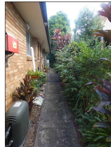
Every inch of space is utilised for plants.