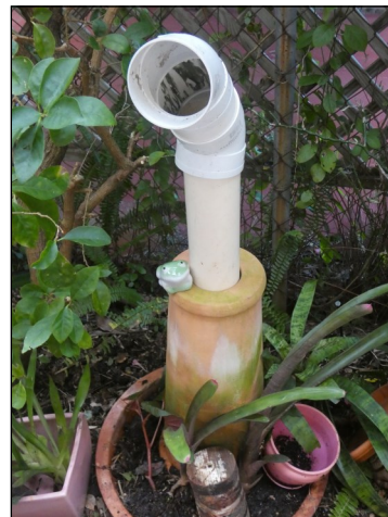
Frog hotel made from a pot and PVC pipe.