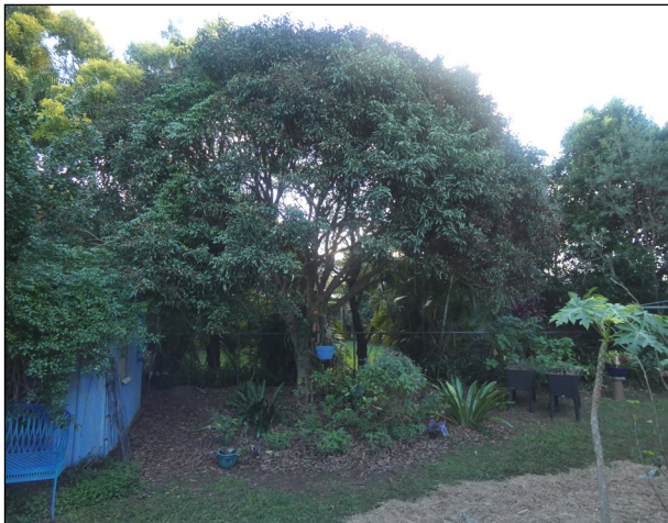
The lychee tree is infected with Erinose mites. Helen doesn't use pesticides, but trusts in the many predatory insects to munch on the mites. The infection has come and gone over the years, but the tree keeps thriving.