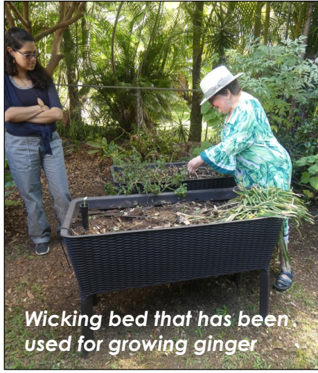
Wicking bed that has been used for growing ginger