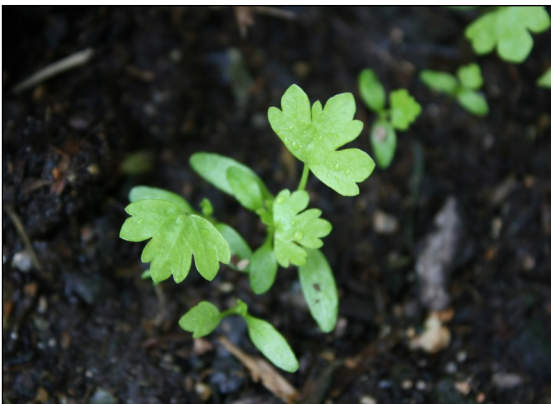
Coriander germinating seedlings

If you like results quickly, plant radish. I've had leaves appearing in just 3 days after sowing in the ground. Radish is well known for its speedy germination rate. Celery seed will take its time and germinate about 14 days after sowing. Beans are quite quick and will be up and about in 5-7 days. Tomatoes can be growing in a week or so too. Brassicas, including cauliflower, broccoli and Asian greens like Pak choy will be showing their first leaves about 7-10 days after sowing.