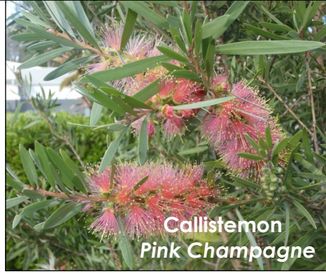
Callistemon Pink Champagne